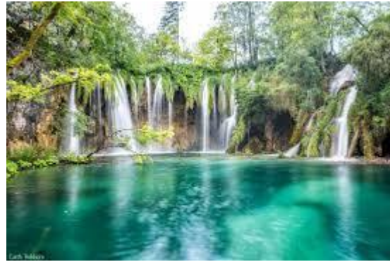
Plitvice National Park