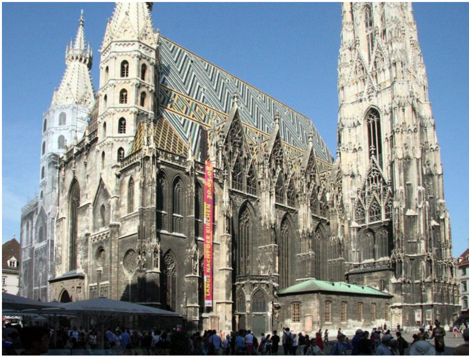
Catedral de San Esteban, Viena

Morning arrival in Vienna and transfer to your hotel. After checking-in, our guide will take us to visit the city of Vienna: We will drive through the Ringstrasse with multiple artistic buildings, will visit The House of 100 Waters by the Danube canal, and the historic quarter including Albertina, Hofburg and Maria Teresa Square. Later time permitting, we will visit the Schönbrunn Palace. Come evening we will enjoy a Welcome Dinner with wine and Show of Viennese Waltzes and Austrian folklore. Overnight in Vienna.