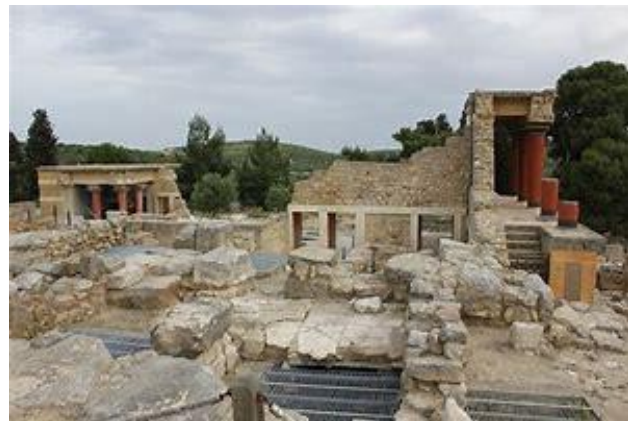
Palacio de Minoan In Knossos

Heraklion, the capital of Crete and its main commercial port is only three miles away from the fantastic ruins of the Knossos Palace. Discovered in 1899 by Sir Arthur Evans and partially rebuilt, it is believed that the elaborate Palace is the mythical labyrinth of King Minos and the headquarters of the ancient culture of Minoan. The Archaeological Museum of Heraklion exhibits many of the treasures found during the excavations.