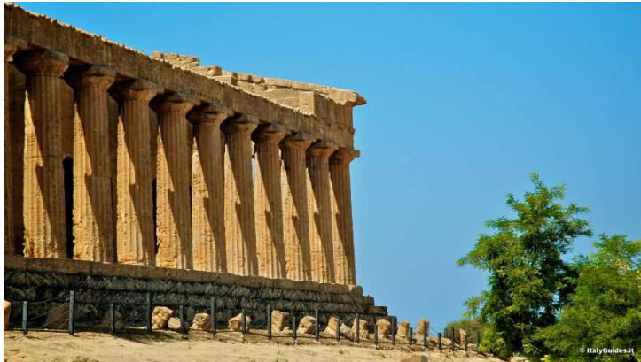
Valle dei Templi, Agrigento, Sicily